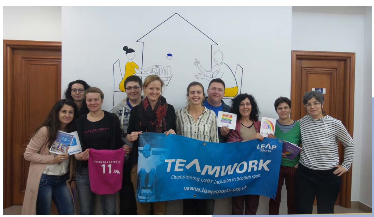
Diverse Identities in Sport - project partners