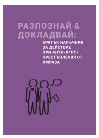
Recognize & Report - handbook for victims on how to report and find support in cases of hate crimes

In 2018 Bilitis finished successfully a two - year long project on anti-LGBT hate crimes. The project is called "Come Forward: Empowering and Supporting Victims of Anti-LGBT hate crimes", co-funded by the Rights, Equality and Citizenship Programme of the European Union and implemented in partnership between 23 organizations and institutions from 9 European Union Member States. The aim of the project was to improve the access to reporting of hate crimes and the provision of support for LGBT people who are victims of homophobic and transphobic attacks by researching, identifying and exchanging good practices and training specialists in the field of dealing with victims of crimes.