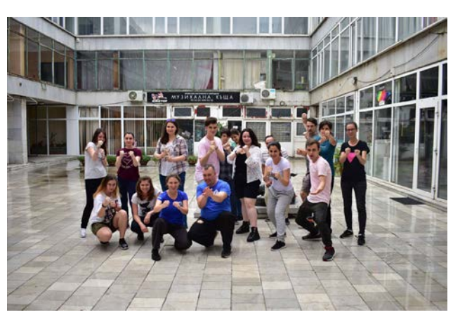
Self-defense workshop, part of the program of Sofia Pride Sports