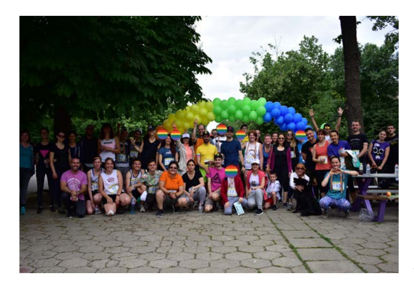
Participants at the Equality Run after the medal ceremony

The Equality Run was funded by the Sofia Municipality Program for Development of Physical Education.