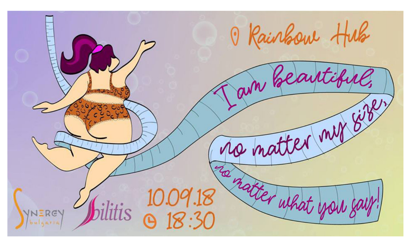
Poster from one of the feminist events on the topic "Fatphobia".

The Queer Feminist Group was the first one to meet on the topic of 'Intersectionality', very important topic in the contemporary feminist movement and suitable base for the future activity of the group. The group was meeting once a month to discuss important for the worldwide feminist movement topics, but also topics that are important for our local context. Some meetings were organized with visiting activists who are specialized in topics such as non-binary identities and fatphobia. The queer feminist group merged in another feminist collective called KEF – eclectic feminism club, which organizes events, addressing pressing feminist issues. We supported the protests by providing and organizing volunteers and logistical support.