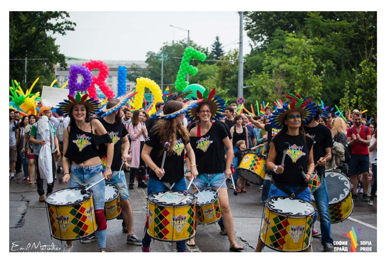
Sofia Pride 2018

Another innovation was the festival atmosphere offered for all guests of the Pride Day! From 4 pm until the beginning of the street March at 7 pm at the gathering point in front of the Monument of the Soviet Army, there was a variety of attractions to attend – information booths with materials and merchandise of the LGBTI organizations, make-up station, photo-booth, messages station, beverages, limited edition products of the businesses who support Pride and various other attractions. A number of companies and businesses attended Pride with their own stands and the festival atmosphere was highlighted by the participation of Ruth Koleva, Ivo Dimchev, Mihaela Fileva, Dancing Sofia, Yambadon, Spice Girls Tribute, Jennifer Benediction and Dead Man's Hat Live who performed on the Pride stage.