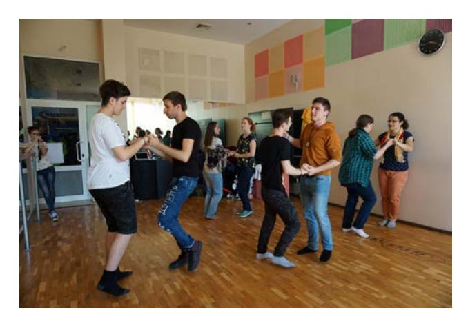
One of the sports events during Sofia Pride Sports -Bachata Dance Class

The first edition of Sofia Pride Sports kicked-off with a same-sex couples bachata dance lesson, followed by the Equality Run.