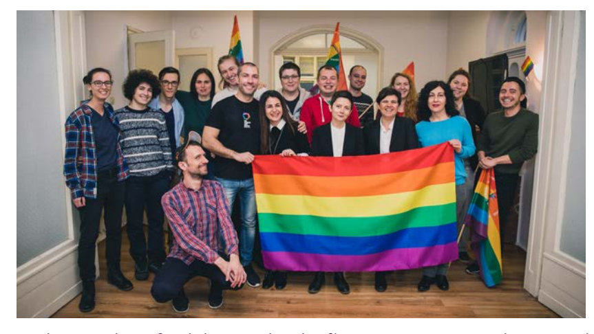
At the opening of Rainbow Hub - the first LGBTI+ community center in Bulgaria