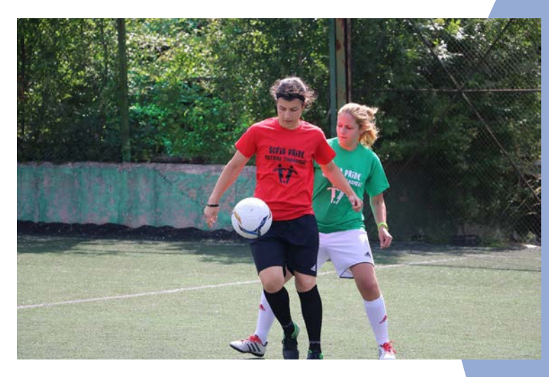
Sofia Pride Football Tournament

The other major event was the first Sofia Pride Football Tournament. The tournament gathered 4 teams of 5 + 1 players. The football tournament was supported and sponsored by FARE network – an umbrella organization that brings together individuals, informal groups and organizations driven to combat inequality in football and use sport as a means for social change