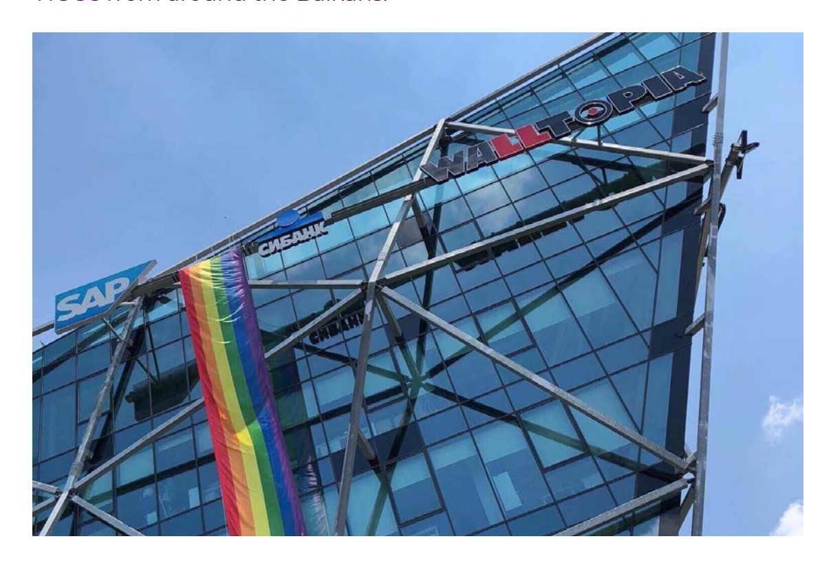
The building of Walltopia with the 21 meter long rainbow flag