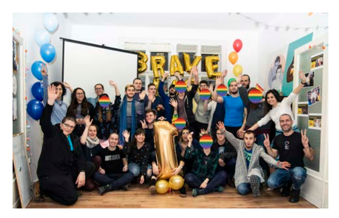
The 1st Birthday of BraveLab

BraveLab started in January 2018 as the first safe space for young people from the LGBTI community in Sofia. Since then young LGBTI people aged 15-29 have regular meetings at the Rainbow Hub to meet and discuss important topics such as awareness of LGBTI identity, coming out, family relationships, workplace and mental health issues, HIV/AIDS prevention and other STIs. BraveLab's goal is to become a sustainable incubator for building confident, capable, and empowered young leaders of the LGBTI community, giving them space to develop their skills, share ideas with peers, and most importantly, build up belief in their own strengths.